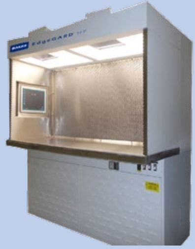
EdgeGARD® HF with PhocusRX®