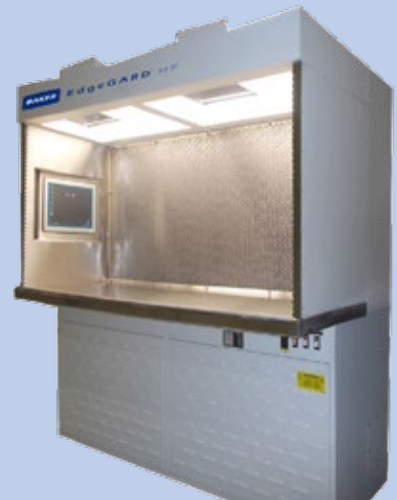
EdgeGARD® HF with PhocusRX®