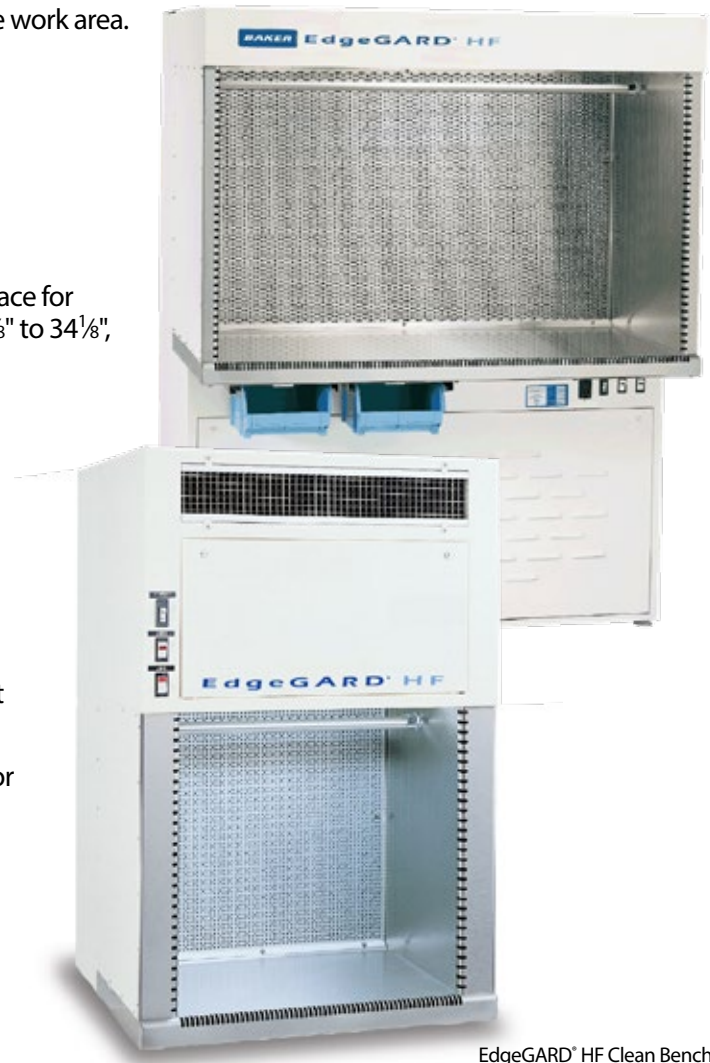
EdgeGARD® HF Clean Benches

NOTE: EdgeGARD clean benches protect product only. They are not designed to contain aerosols generated in the work area and do not protect personnel or the environment.